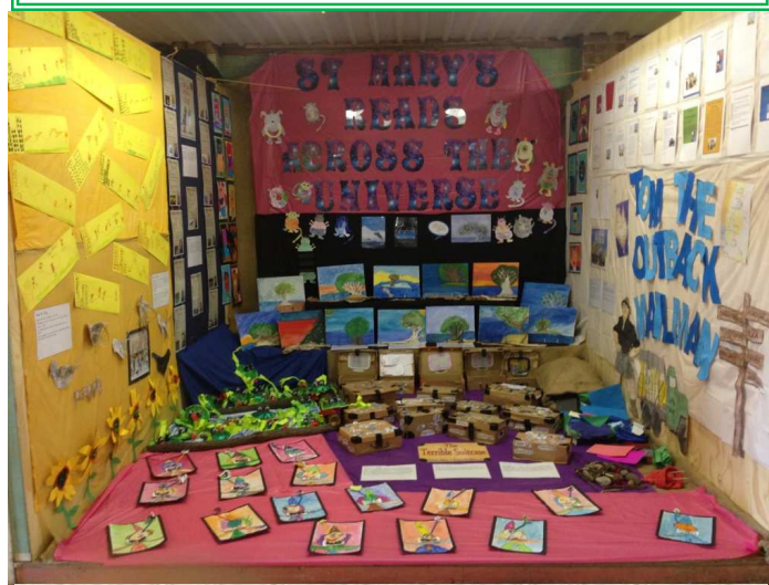
St Mary's Show Display Read Across The Universe

Parents of students in Year 2/3 are invited to attend a watch a dance performance by the children.