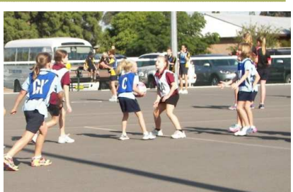
SCENES FROM THE NETBALL GALA DAY HELD YESTERDAY